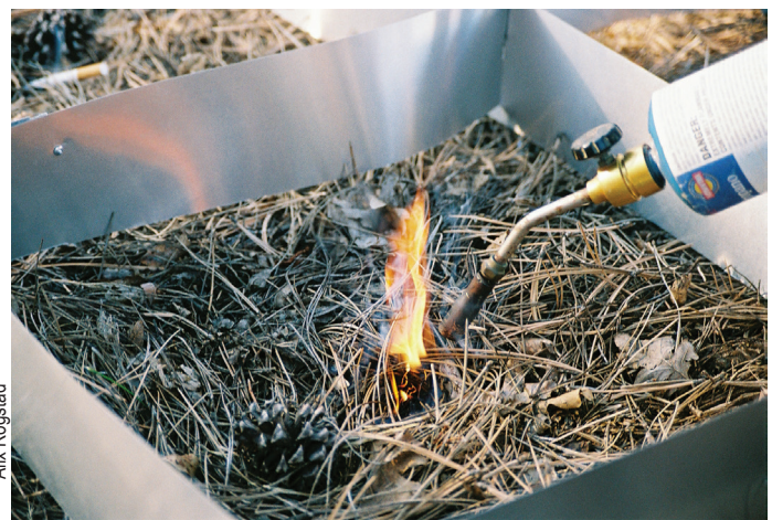
Figure 2. Propane torch igniting the pine needles.

Protection Plans, which emphasizes fuel reduction to protect homes, properties and communities. As fuel reduction projects are being implemented across Arizona's woodlands and forests, much of the resulting debris is chipped and either spread back onto the site or taken to another location to be burned or used as wood chip mulch. Little is known about the flammability of this form of mulch, however, so an experiment was devised to test the relative ignition rate of this wood chip debris as well as seven other commercially available mulches using three different ignition sources. The objective was to determine the best mulch alternatives for Arizona's landscapes for their unique arid environments. The flammability of plants recommended for Firewise landscapes will not be addressed in this publication.