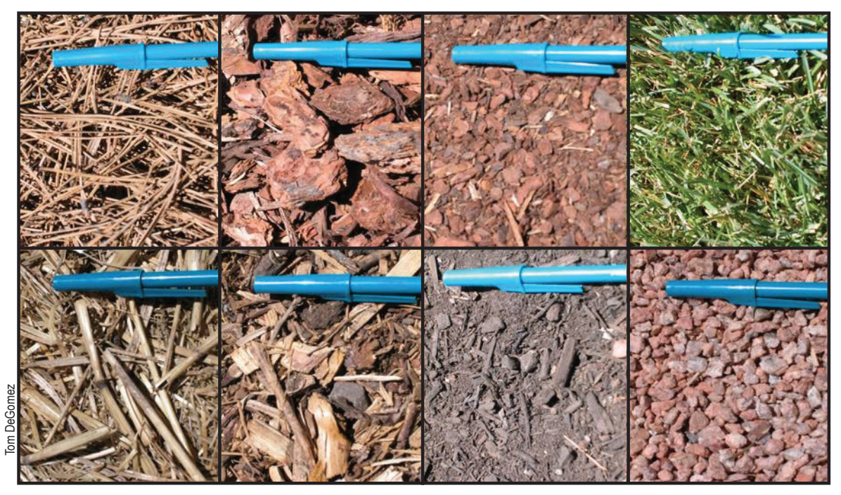
Figure 1. The eight mulches used from the upper left corner and clock wise: pine needles, bark nuggets, shredded bark, grass sod, decomposed granite (DG), garden compost, wood chips, and wheat straw.

Alix Rogstad, Tom DeGomez, Chris Hayes, Jeff Schalau and Jack Kelly