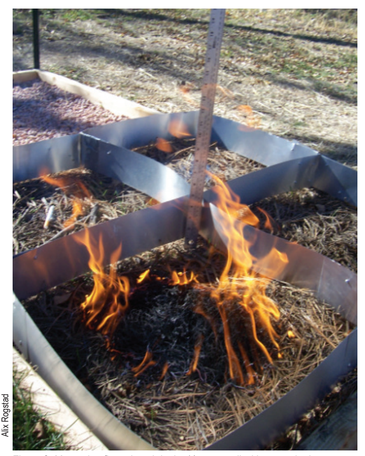
Figure 3. Measuring flame length in the 1/4 meter cell with a metal ruler.

Three ignition sources, a lit cigarette, a charcoal briquette, and a propane torch were used to test the relative ignition rate and flammability of the mulch. The ignition sources were selected to simulate various scenarios in a real-world wildfire setting. The propane torch was selected to simulate the flame front from a ground fire moving to the mulch; the charcoal briquette was selected to simulate a fire-brand (ember) being blown onto the mulch from an adjacent wind driven crown fire; and the cigarette was selected to simulate a carelessly tossed cigarette into the mulch. The center of three of the four \frac{1}{4} m<sup>2</sup> (10.8 ft<sup>2</sup>) quadrants within a cell was subjected to heat from either a hand held propane torch for 15 seconds (Figure 2), a burned white Kingsford® self lighting charcoal briquette for 5 minutes, or a lit Montego® regular filter cigarette until the cigarette fully self consumed (Steward et al. 2003). If the mulch ignited it was allowed to burn to the edge of the \frac{1}{4} m<sup>2</sup> (10.8 ft<sup>2</sup>) quadrant before it was extinguished. In the event of slow moving flames (or smoldering), any cell that did not fully consume the <sup>1</sup>/<sub>4</sub> m<sup>2</sup>