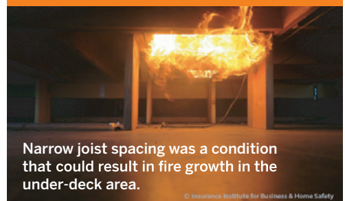
Narrow joist spacing was a condition that could result in fire growth in the under-deck area.