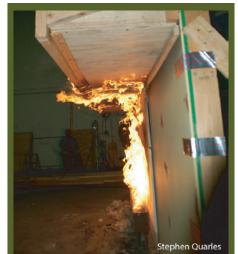
Lateral flame spread was reduced when a combustibile soffit material ignited in this test of a soffited-eave with a combustibile soffit material.