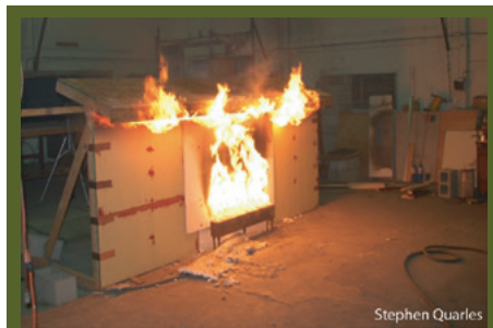
Flame impingement exposure to the underside of the eave, and time-to-ignition of the joists, blocking and fascia was quicker; and lateral flame spread faster, when an open-eave design was used in research experiments.