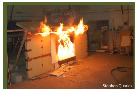
Flame impingement exposure to the underside of the eave, and time-to-ignition of the joists, blocking and fascia was quicker; and lateral flame spread faster, when an open-eave design was used in research experiments.