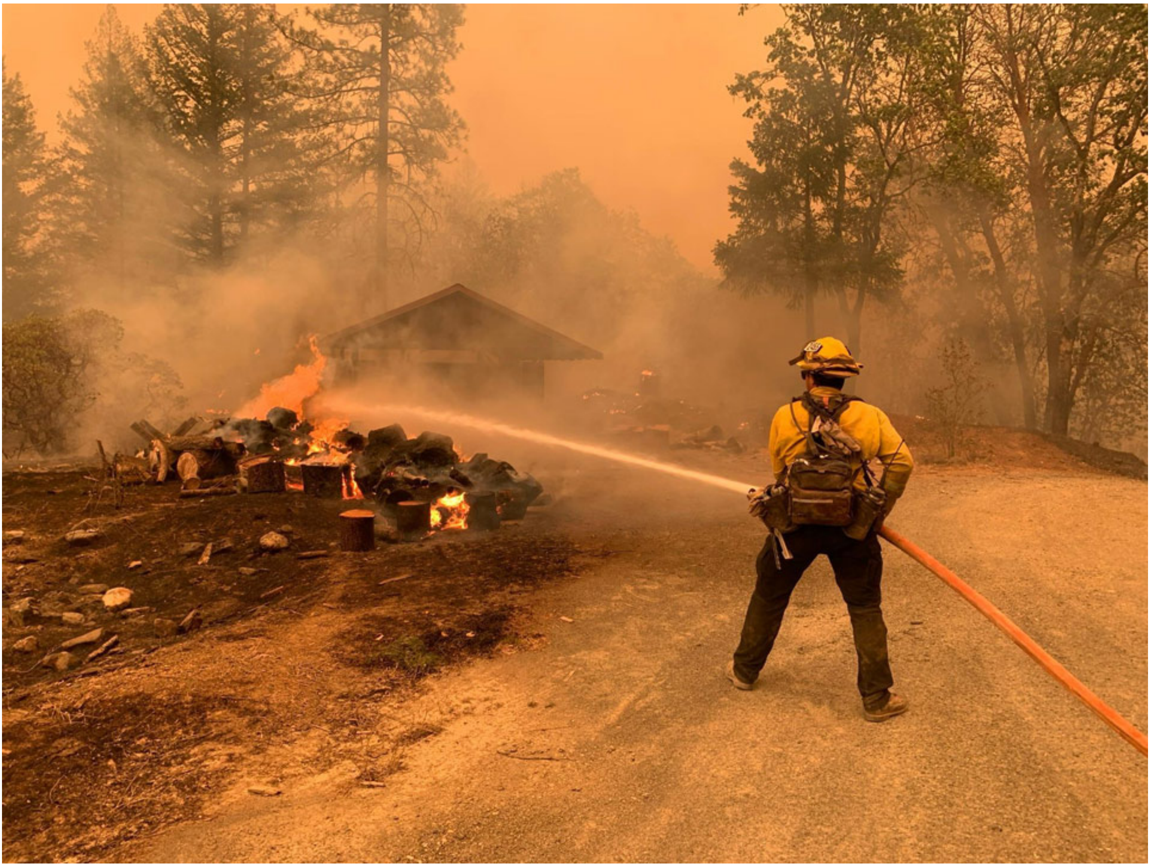
2021 California Monument Fire - Engine crew battles flames