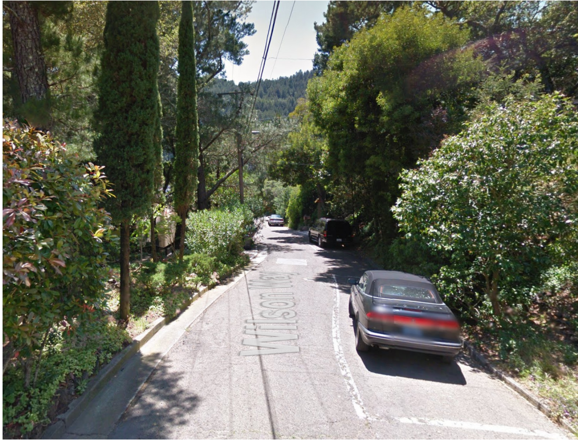
DURING AND AFTER PHOTOS