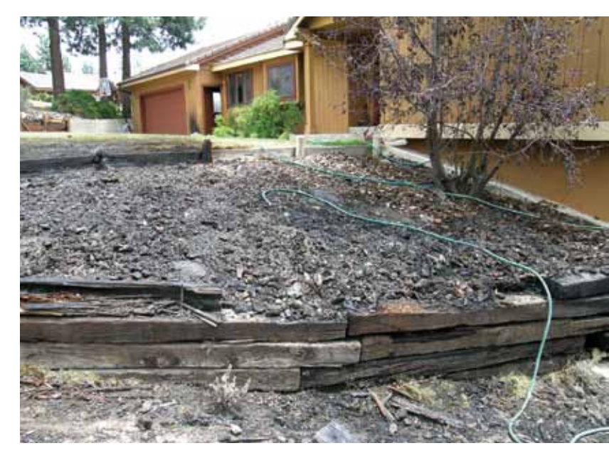
Figure 1. Embers from an oncoming wildfire ignited the pine bark nugget mulch in this flowerbed. The burning mulch then ignited landscape timbers and scorched the adjacent lawn. Fortunately, the house was separated from the mulch by lawn and a concrete sidewalk.

Unfortunately, despite the positive attributes, many mulches are combustible, a major drawback when used in home landscapes located in wildfire-prone areas (Figure 1). A combustible material is defined as one capable of igniting and burning (Berube 1991). In 2008, an evaluation of mulch combustibility was performed in Carson City, Nev., by the Carson City Fire Department, Nevada Tahoe Conservation District, University of California Cooperative Extension and University of Nevada Cooperative Extension. Using the results from this project, recommendations are offered concerning the use of mulches in wildfire hazard areas.