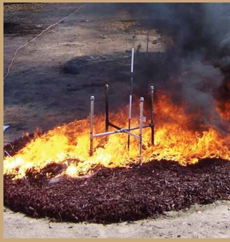
Figure 4. Rubber mulch produced the greatest flame height and temperature of the mulch treatments evaluated in this study.

Figure 6. The composted wood chip product, Fertile Mulch, primarily burned through smoldering combustion as indicated by the darker areas and smoke. It produced very little flame and had the slowest rate of fire spread of the mulch treatments evaluated.